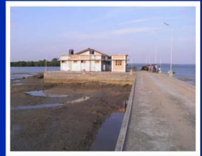
Fish Landing Centre at Pokadera, Mayabunder