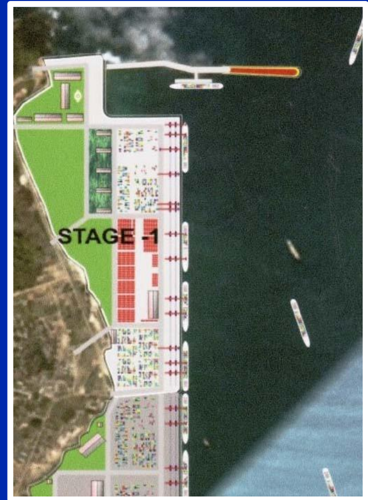
Proposed Transshipment Port